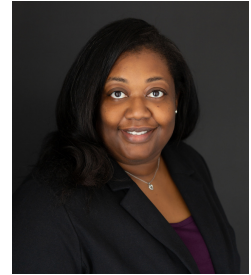
ABENI WELCOME FAMILY CONNECTIONS COORDINATOR