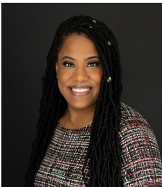
FAITH WALKER MIDDLE & HIGH SCHOOL SUCCESS/ INFANT & TODDLER ASSISTANT