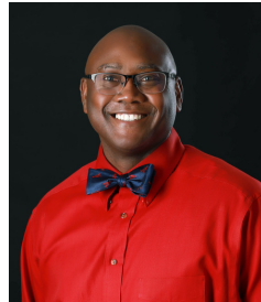
ANTHONY BELL MIDDLE SCHOOL & HIGH SCHOOL SUCCESS